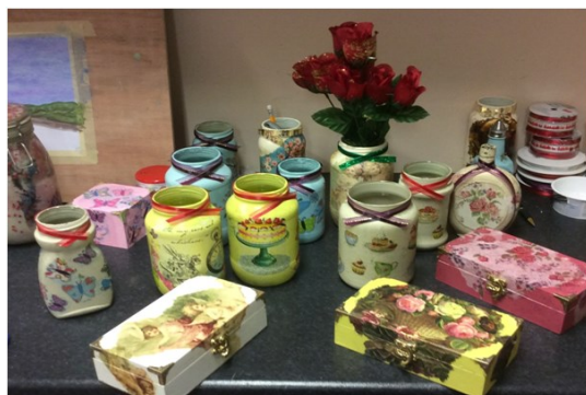
Some of the great work being done this Christmas by Armagh Men's Shed