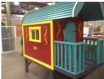
The men made a traditional Wagon which is being raffled to raise funds for the Southern Area Hospice.