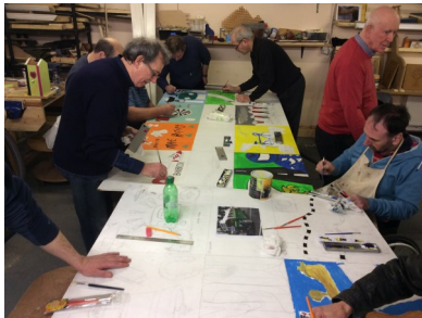
Men talking part in Reminiscence Course