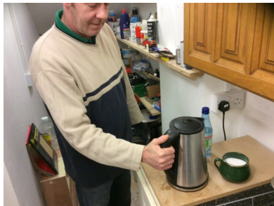
The Kettle is the most important tool in any mens shed.