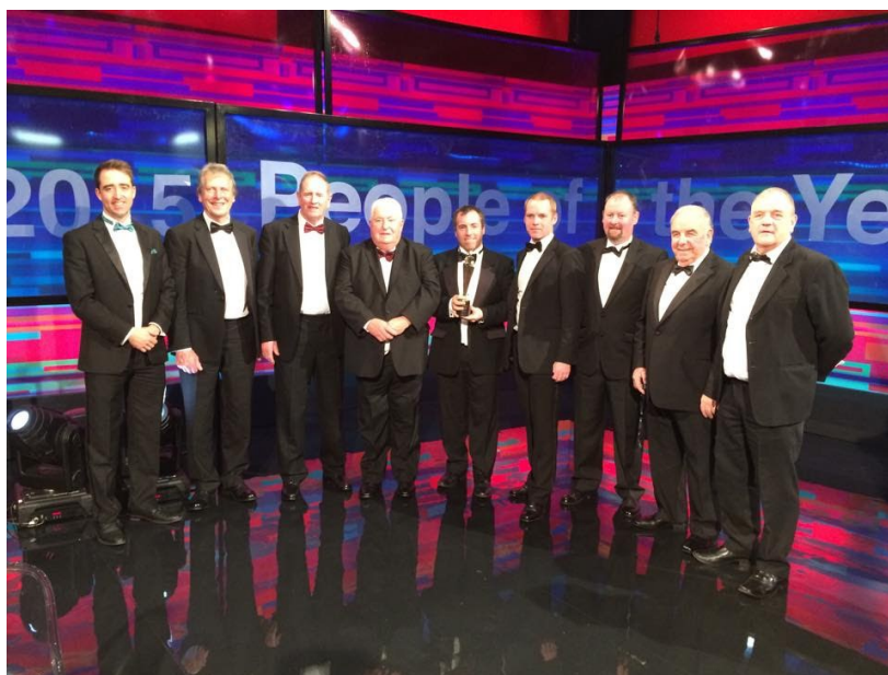
IMSA Board Members and Guests attended the event