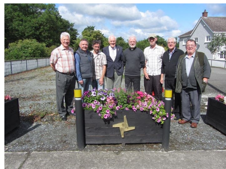
In this picture, the wonderful planters the Shedders made which they tend to regularly.