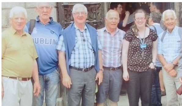
Members of the Dunleer Men's Shed on a recent trip to Kilmainham Jail with their guide.